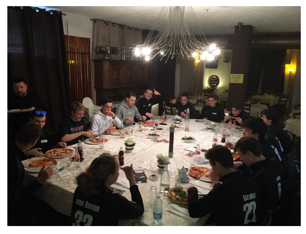
The Boys' volleyball team enjoying a cozy and proper Italian meal after a long and exhausting day playing football.

Saturday, the last and long-awaited day, when the students from the 19 schools had to perform in the aquathon. This was the last strike of Eurosport and Bergen was prepared for the challenge. The competition consisted of running 600 meters, swimming 50 meters and running 200 meters before reaching the start line where the player had to hand the baton to the next athlete who would take over and repeat the same circuit. 20 students had to participate in this last contest of the Eurosport's tournament 2019, and Bergen was able to perform consistently in the last game before returning home.