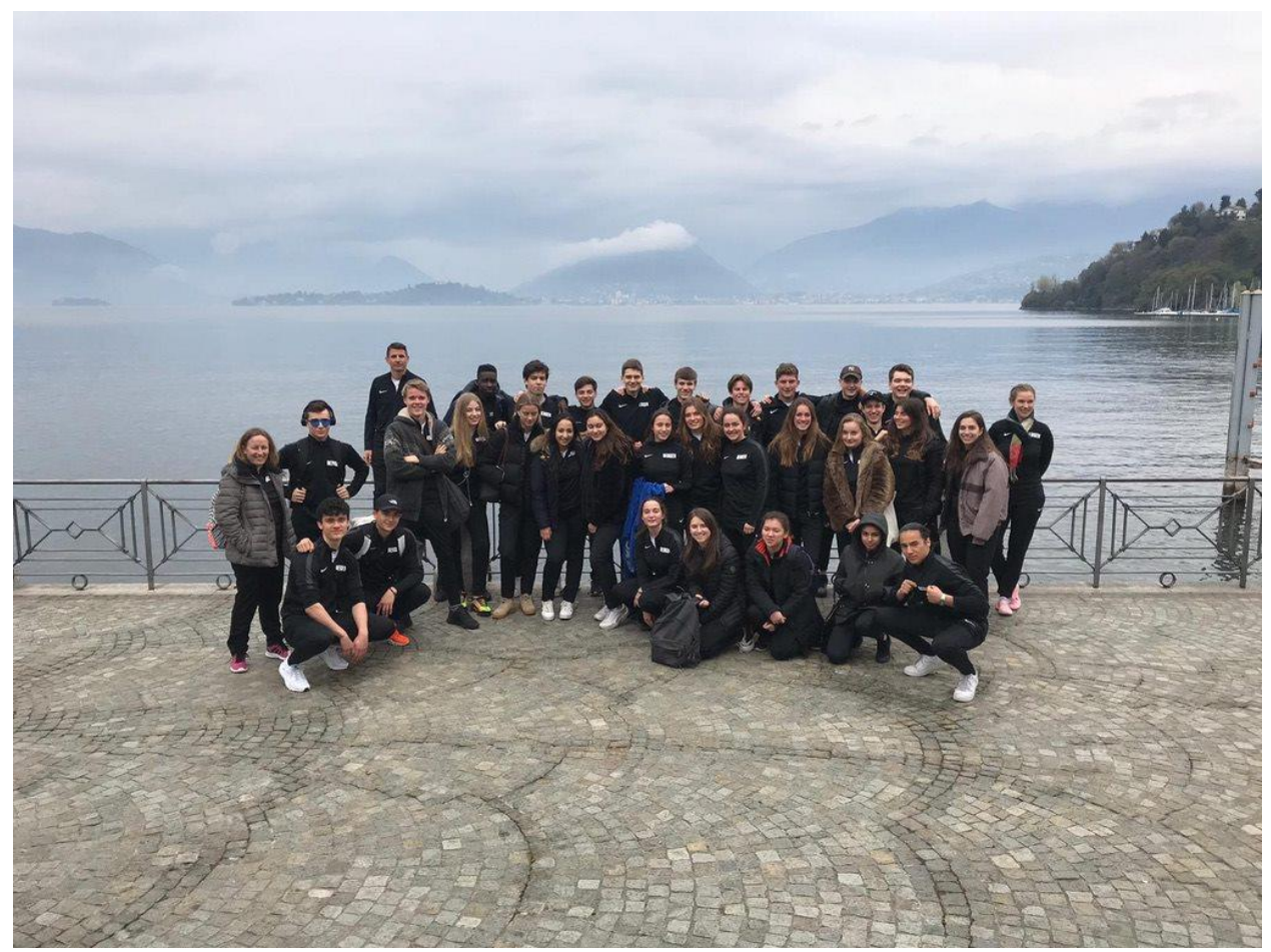
Bergen's team for Eurosport 2019 in Varese, Italy